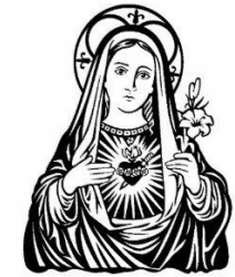
Our Lady of the Sacred Heart

Archdiocese of Birmingham Registered Charity 234216